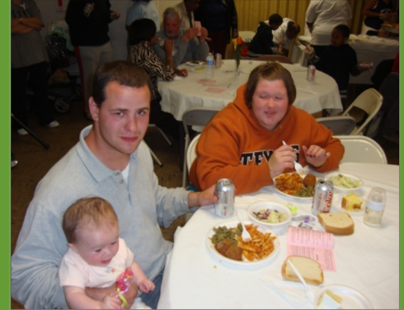
A family enjoys a dinner at the Pottstown Site. Many families may still have a roof over their head but still need our assistance to make ends meet.

*Philadelphia 2011: The state of the City